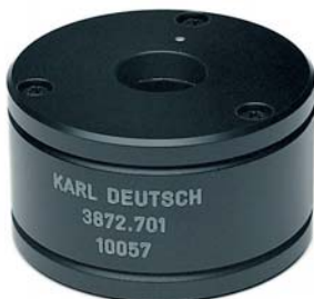
Zero field chamber