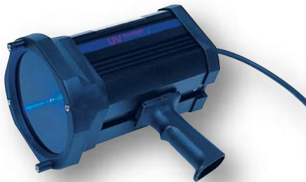
UV-Spotlight PH 3819 with built-in electronic ballast