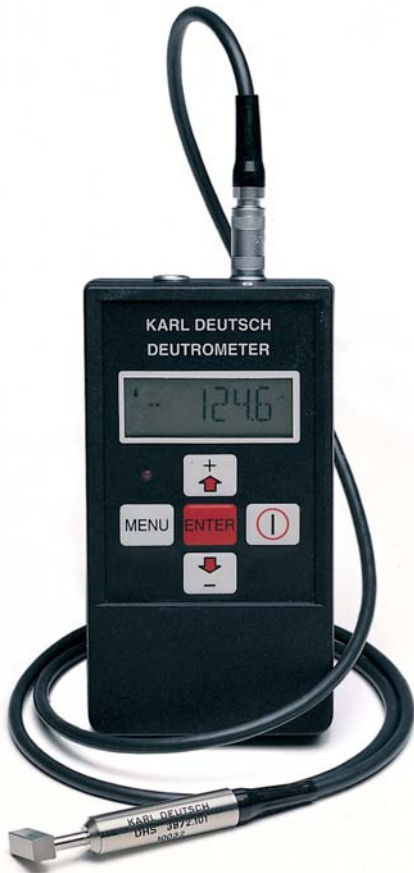
DEUTROMETER II with probe, angled for 90°