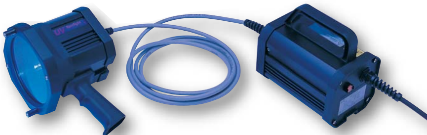
UV-Spotlight PS 3818 with separate electronic ballast

Weight: PH 3819: 2.25 kgs PS 3818: Lamp 1.2 kgs Electronic ballast 1.5 kgs