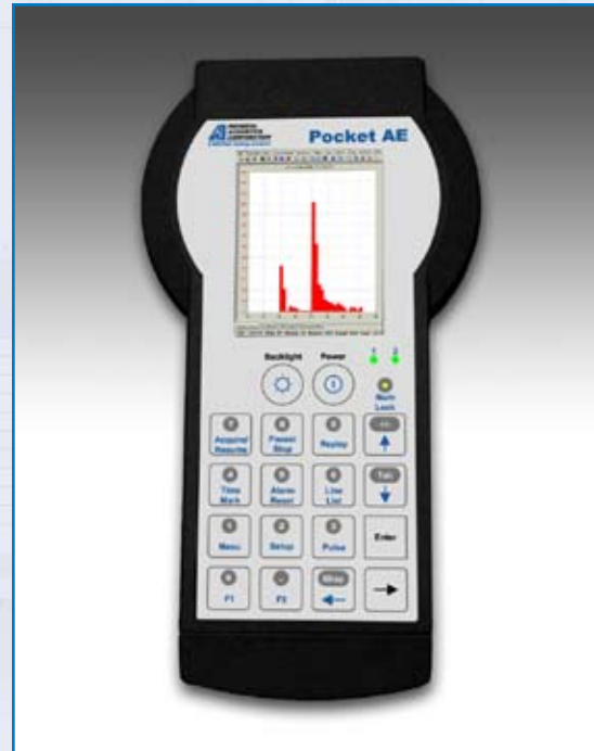
The Pocket AE-2 hand-held unit with protective rubber boot for reliable operation in any environment.

by utilizing its 2 channel AE capability and 1 channel parametric input for correlating load or stress with AE activity. In addition, linear location and spatial filtering capabilities are built-in to provide even more versatility in the lab and field. There is even a 16 bit parametric input channel to measure cause and effect relationship between AE status and other sensors.